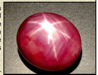
Above: Star Ruby (Note the hexagonal arrangement of rutile crystals)

Overall, asterism has captivated the minds of scientists, historians, and the mineral collector alike. And, even though I still have some regrets about my first encounter with the phenomenon, it has brought me more insight into the extensive world of gems and minerals!