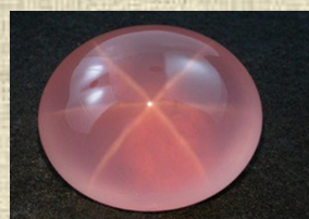
Above: Star rose quartz exhibiting diasterism

Surprisingly, the seemingly pure sparkle of these unique stones are the cause of impurities within the gemstone itself. As corundum (a.k.a. ruby and sapphire) crystals grow in a hexagonal barrel-shaped form, microscopic acicular (needle-shaped) crystals of rutile, a titanium oxide [TiO 2 ], grow in densely-packed structures parallel to the faces of the crystal, making the internal crystalline structure look like a bunch of concentric hexagons when viewed with the naked eye. When a lapidary cuts a corundum crystal width-wise, and polishes a dome on one of the cut ends, a bright star may appear to be floating on the dome. As light shines down upon the gem, the metallic rutile inclusions reflect and concentrate the light, forming a bright star whose rays are perpendicular to the rutile needles. This type of asterism is called epiasterism , where light is shown onto the rutile-laden gemstone. Most other asteriated gems such as star-garnet and cymophane also showcase their stars in this method.