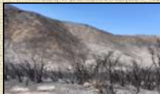
The Blue Cut - as seen at our July field trip, and during the fire that started August 16th. Appreciate the opportunities that an active lapidary club can give us!

What did you find on a field trip, vacation or show? Send a photo and description of your find to the Editor by the 15th of the month! We'd all like to see them!