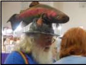
Left: Hosted by the Northwest Federation of Mineralogical Societies (NWFMS), everyone was in the spirit of the day!