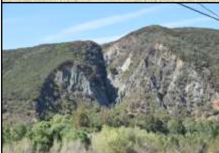
Left: Don Ogden showed us the famous Blue Cut, where the North American Plate (left side) grinds against the Pacific Plate (right side) in a dramatic show of titanic geologic impact!