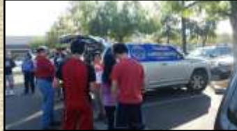
Right: PLS members were joined by folks from the Searchers, North Orange County, Delvers and El Cajon Valley clubs.