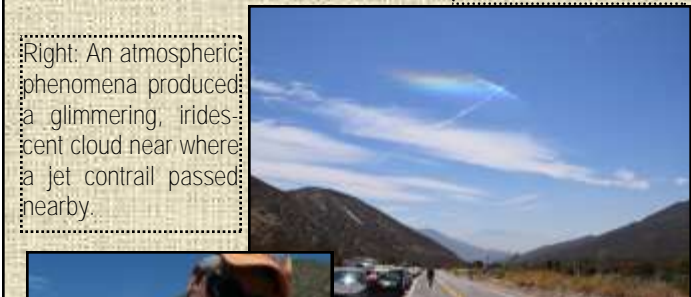
Right: An atmospheric phenomena produced a shimmering, iridescent cloud near where a jet contrail passed nearby.